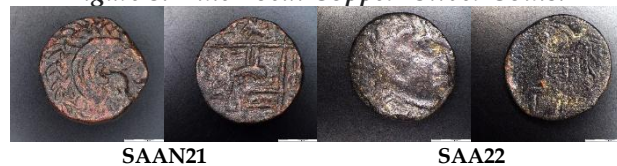
Figure 4: Two Local Pure Copper Coins.