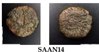
Figure 6: King Abhiraka Coin.