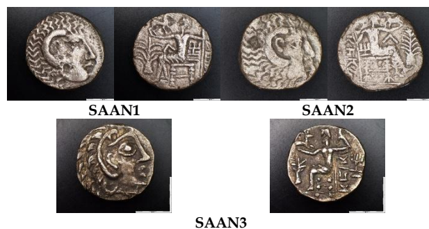
Figure 2: Three Local Versions of the Silver Greek Tetradrachm.