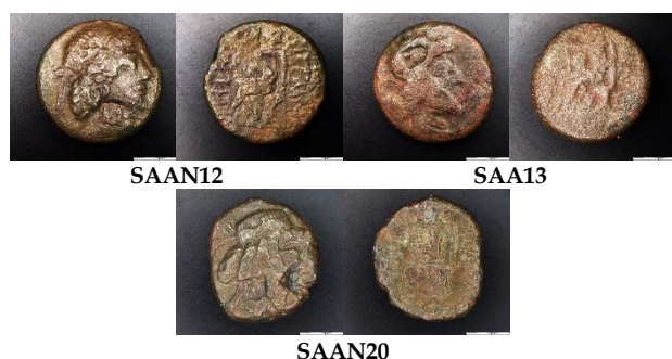
Figure 5: King Attambelos IV Coins.

Each coin was individually weighed with a sensitive balance (Model MS204S, Mettler Toledo, Switzerland) that has a resolution of 0.1 mg, and photographed against a reference grid (10 mm/division). Ultimately, the coins were analyzed using an XRF analyzer (Niton™ XL3t GOLDD+, Thermo-Fisher Scientific, USA). It has an X-ray tube with a Silver (Ag) anode excitation source, operating at 50 kV and 200 micro-Ampere and an optimized silicon drift detector (SDD). It has an energy resolution of 180 eV (FWHM) at 5.95 keV Mn K-alpha line, capable of detecting chemical elements from Mg to U very efficiently. Collected spectra were de-convoluted to calculate the element concentrations as mass% of the analyzed sample area, within a 3 \sigma (99.7%) certainty. Elements are categorized as major, minor or trace depending on their concentrations as mass%, where major is 10 – 100%, minor is 0.1 > < 10% and trace is < 0.1%.