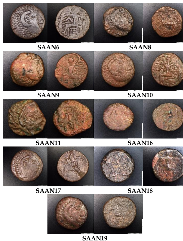
Figure 3: Nine Local Copper-Silver Coins.