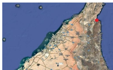
Figure 1: Red Dot Shows the Location of Dibba.

The objective of our research is to utilize modern analytical methods to study a coin collection discovered in the ancient port of Dibba Alhisn, United Arab Emirates. With the aim of identifying their chemical composition and provenance. XRF analysis will reveal Very important differences in the major and trace elements. These can be related to the geology of the ore and/or the mines from which they are extracted, the technological process of purification, the environment of burial, and the purity of the precious metals, as well as provide additional information for numismatic studies.