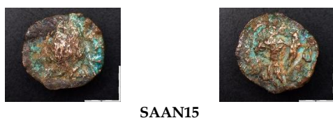
Figure 7: Foreign Coin Lacking Distinctive Features.